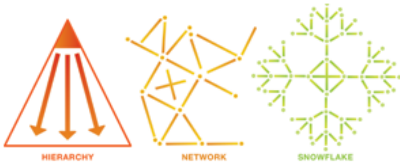
Figure 8: Three different types of social movement structures

expansive umbrella structure: the United Liberation Movement for West Papua (ULMWP).