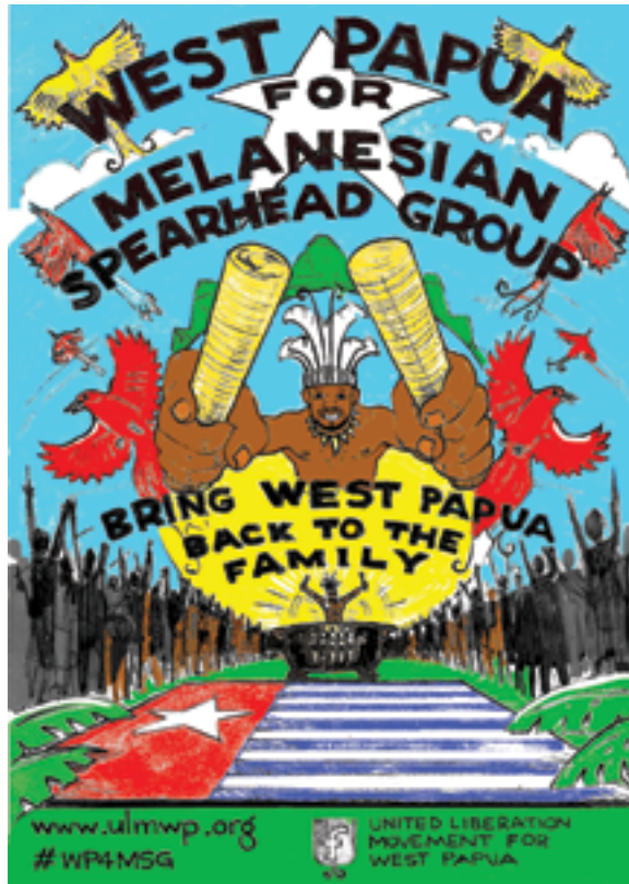
Figure 10: The Bring West Papua Back to the Family 2015 campaign poster Credit: Designed and drawn by Michael Kumnick based on conversations facilitated by Pasifika with ULMWP leaders, solidarity activists, and community leaders from Oceania

As activists and Quakers, we need to develop our skills and experience in order to simultaneously develop all four dimensions —dialogue, normative action, strategy and utopian enactment— holding each in creative tension, each one complementing another. The synergy results in more-powerful nonviolent action and the possibility of more coordinated collective action. Strategy