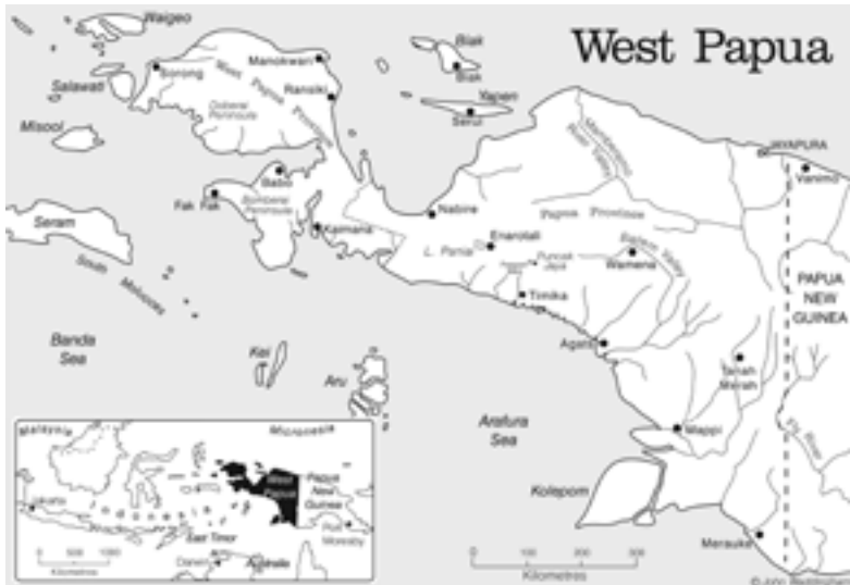
Figure 1: Map of West Papua and neighbouring countries

Back then, the place that was on everyone’s lips, especially after the Dili massacre in 1991, was East Timor. 2 I threw myself into that struggle. Many people campaigned against the Australian oil companies Petroz and Woodside, who were cosyng up to the Indonesian dictator Suharto to exploit oil and gas reserves in the Timor Sea. We organised sanctuary for Timorese threatened with deportation. We planned nonviolent actions to disrupt the arming and training of the Indonesian military.