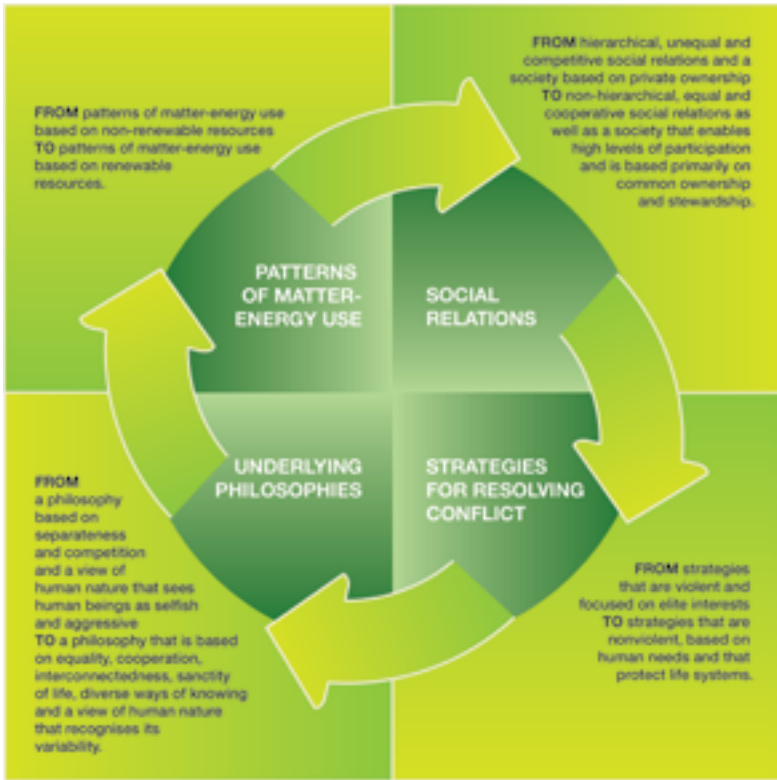
Figure 6: The four mutually reinforcing elements of a society's social cosmology and directional flows away from the dominant cosmology of empire towards freedom and the 'good life'. Adapted from Burrowes (1996, 1–3). Designed by Jason MacLeod and Kym Thomas.

As a solidarity worker, I am listening for how and when the dream of a nonviolent society aligns with the dreams of the West Papuans I am accompanying. That alignment is often partial. What is important is that the specific activities and larger programs we are working on contribute to integrated, Indigenous cosmological visions of 'the good life'. The dreams that spark collective action arrive in many different forms. For instance, they may come as visits from the ancestors, such as the ones received by Denis.