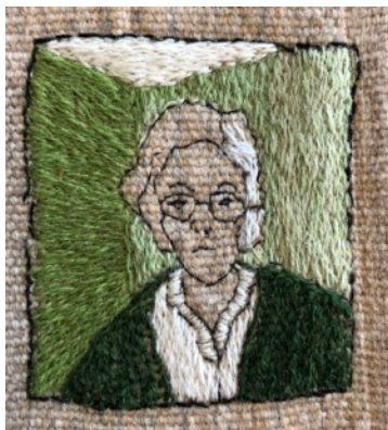
a work in progress.

If you would like to try it, I can send you the materials you need. It doesn't matter if it looks like you, or anything like a photograph. This is art, community art and we welcome all styles. This is an easy start for someone who has not embroidered before - indeed I have been told the Royal School of Needlework children's class does a similar project to get the kids involved: stitch a selfie. Once you have a basic drawing, it is only a very small embroidery and you do a practice piece before you embroider onto the big panel. Why not have a go?