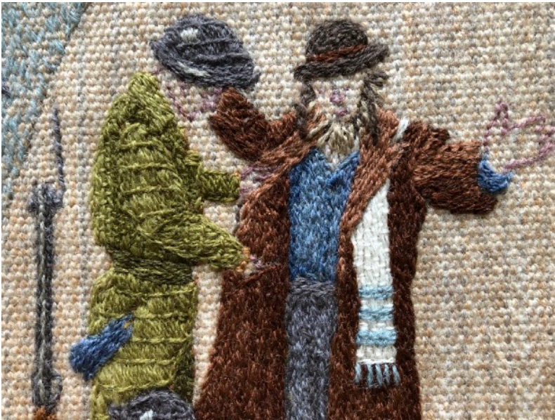
detail from The Dunera Boys

Here are the two new ones. They are $5 each, plus postage.