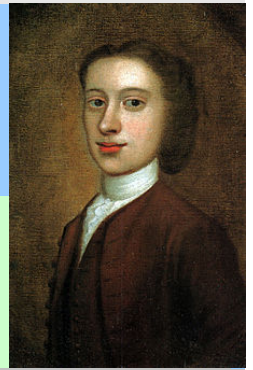
Image: Sydney Parkinson self-portrait. Illustrator Parkinson was the first Friend to visit Australia, with James Cook in 1770. At the time, global concentrations of carbon dioxide were about 270 parts per million. In 2015 ppm now exceed 400.