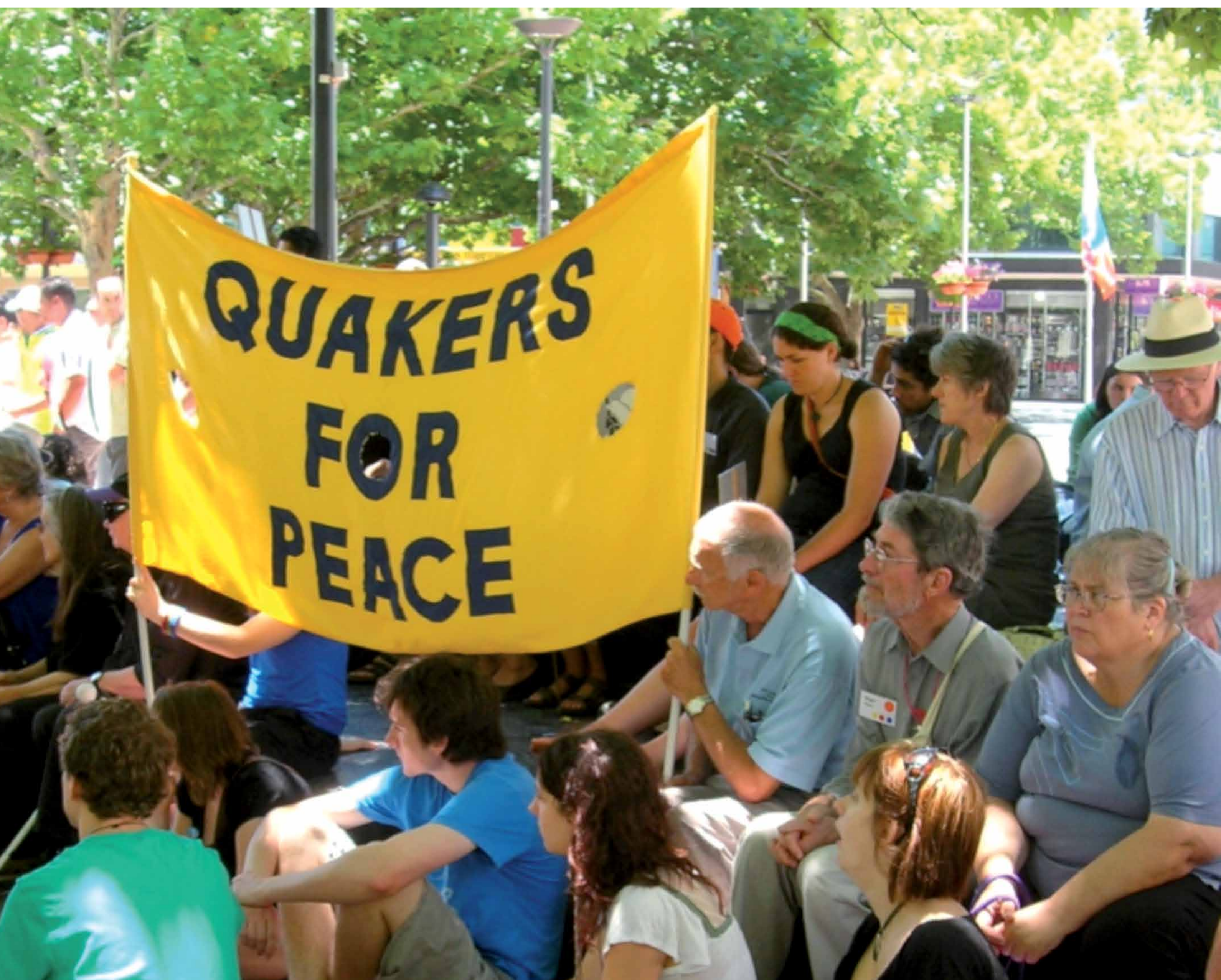
Silent vigil in Canberra during Quaker Yearly Meeting 2009.

“Let us all go forth in a spirit of love and truth and peace, answering to that same spirit in everyone.”