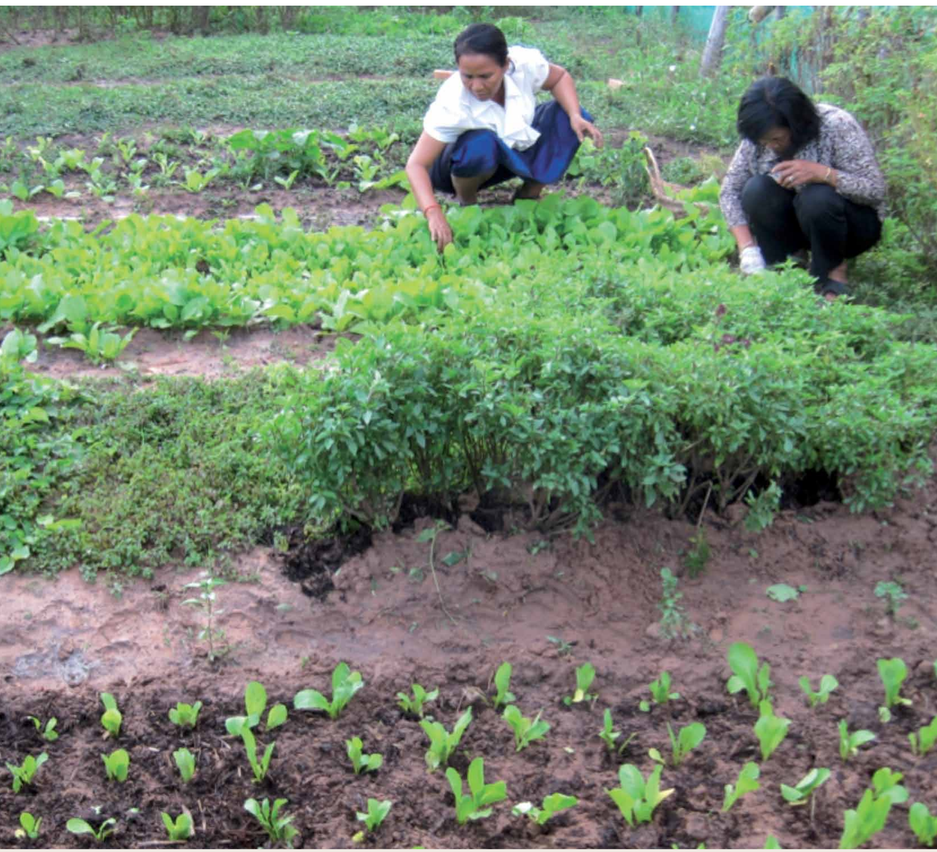
Villagers in Kampong Thom, Cambodia training in food security techniques, funded by QSA and Australian Government foreign aid.