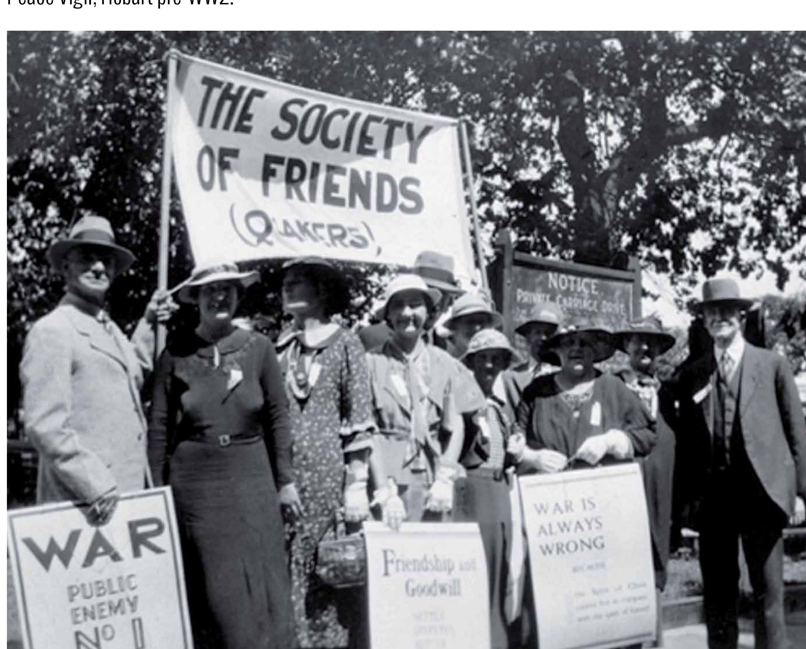
Quakers in Anti-war Protest, Perth — c. WW2 period